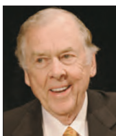
T. Boone Pickens 2008*