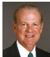
James A. Baker, III 2013