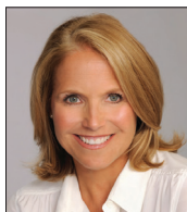
Katie Couric 2011