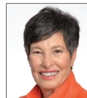
Lyda Hill 2019