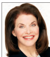
Sherry Lansing 2007