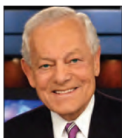
Bob Schieffer 2007

A Conversation With A Living Legend, Dallas