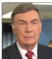
Sam Donaldson 2007