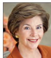
Laura Bush 2009